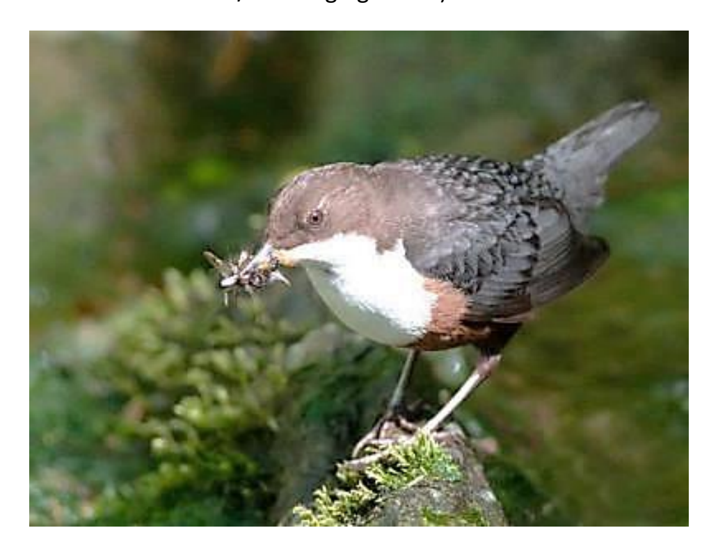
White-throated Dipper aka European Dipper

While underwater the dipper collects its food (which is often "epibenthic", i.e., located on top of the stream-bottom sediments), such as caddisfly larvae (and other insect larvae), as well as small freshwater mollusks, fish, and amphibians — and a favorite freshwater crustacean, the thin amphipod shrimp (of the genus Gammarus , a genus containing marine "scud", estuarial, and freshwater shrimps known for their detritivorous / scavenging habits).